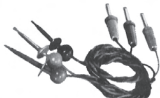
MINI-LOCK CLIP LEADS MODEL FP-6