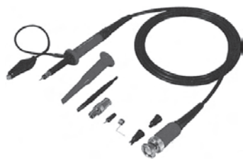
DELUXE MODEL PR-37A