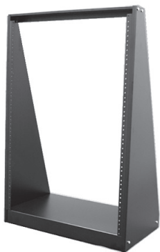
TABLE TOP RELAY RACK