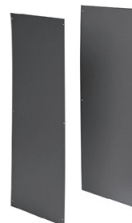
1459 SIDE PANELS