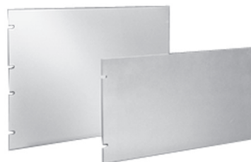
STEEL RACK PANELS