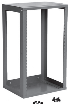
1459 SERIES OPEN TABLE CASE/WALL RACK