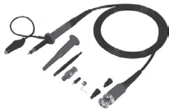
DELUXE MODEL PR-37A