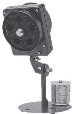
SOLDER NOT INCLUDED