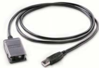
U5481A IR-to-USB cable