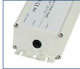
D / Blank Type